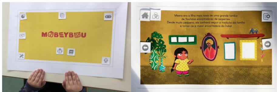
Figure 3. Child observing the paper prototype with chosen hotspot cards, the home page (left) and an inner page (right).

Following the first assessment, the researcher invited the children to position their preferred hotspot icon card on the picturebook app prototype. The researcher ensured that the child remembered the function of each hotspot and, if necessary, he explained the purpose of each button (see Figure 3).