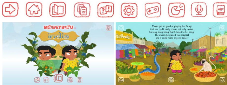
Figure 5. The redesigned hotspots (top) in the digital prototype on the app home page (bottom left) and on an inner app page (bottom right).

Outgoing from the data collected in the intervention we developed a digital prototype, which contained the home page and four pages of the picturebook. To better design the new icons, we analyzed and compared all the collected data following three principles for designing graphical interfaces for children [23]: Obvious visibility; Visual resemblance; and Conceptual resemblance.