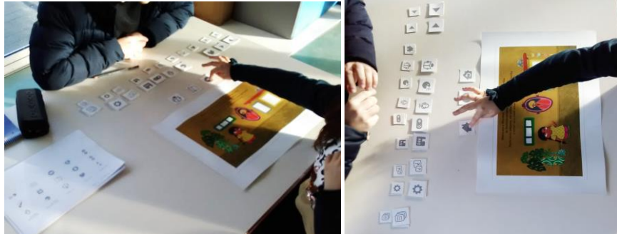
Figure 1: The researcher observing the children choosing their preferred icon cards for the hotspots "start reading" (left) and "navigation to the home page" (right).