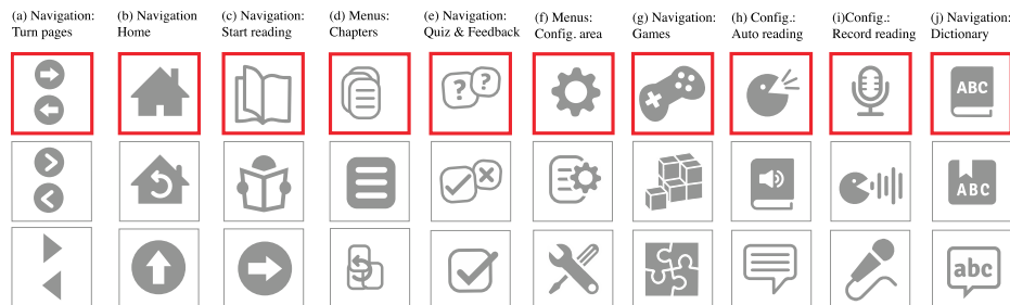
Figure 2: The 3 different proposals for each hotspot where the first row displays children's preferred choices.